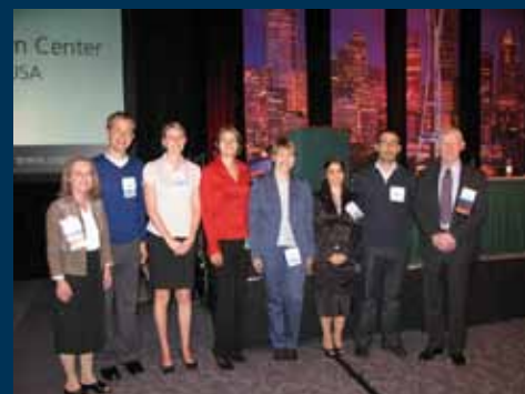
6 Excellence in Research Awards given to post-doctoral fellows and students

Submission Site live on November 1, 2012 Abstract Submission Deadline: January 17, 2012