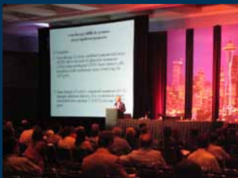
Approximately 1000 abstracts are presented each year at the ASGCT Annual Meeting